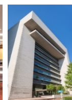
Nihonbashi Life Science Hub