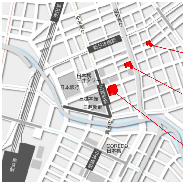
Nihonbashi Life Science Building2 (31VENTURES Life Bridge Nihonbashi)

Muromachi Chibagin Mitsui Building, 1-5-5, Nihombashi Muromachi, Chuo-ku, Tokyo) and promising life science startup companies are tenants of Nihonbashi Life Science Building2 (3-11-5, Nihonbashi Honcho, Chuo-ku, Tokyo). More than 100 seminars, symposiums, and other events were held in the above places of interaction during the past 12 months. With the start of LINK-J, further interactions are expected in the three bases in Nihonbashi now and in the future.