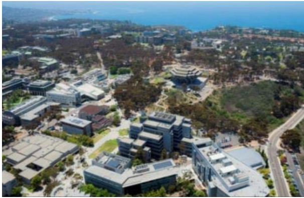
UC San Diego