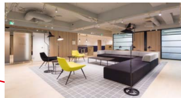
Nihonbashi Life Science Building