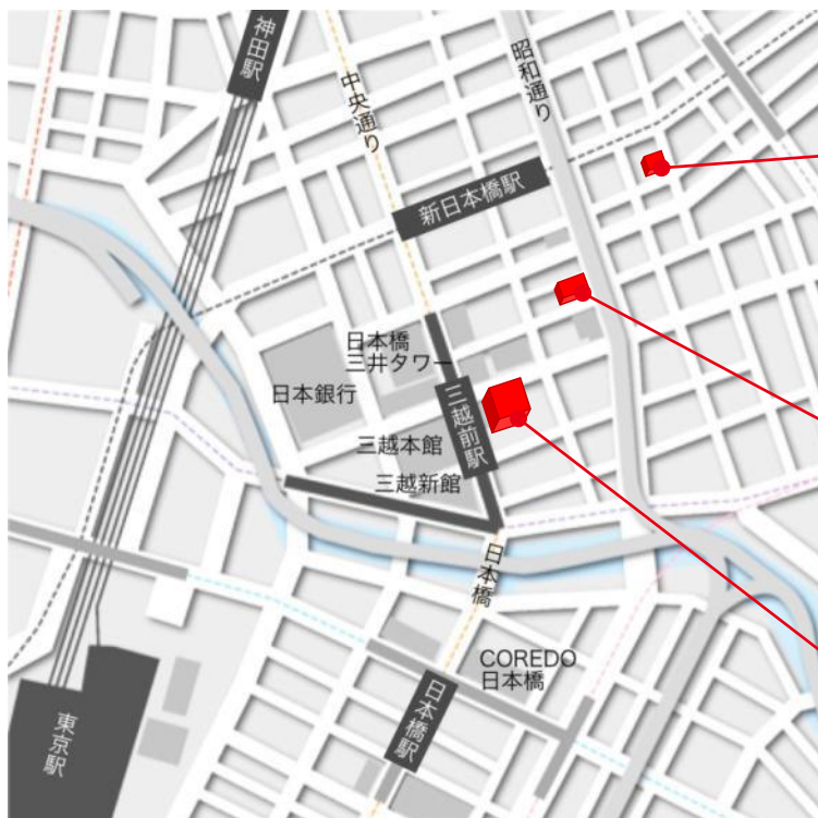
Nihonbashi Life Science Building 2

Mitsui Fudosan has created the following life science bases in Nihonbashi.