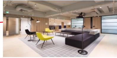
Nihonbashi Life Science Building