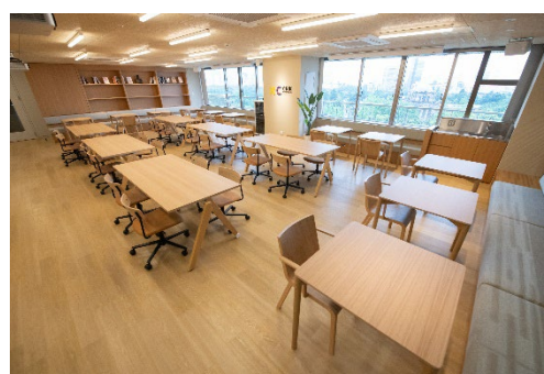
<CRIK Shinanomachi community space>