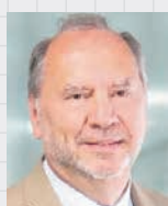
Peter Karel Piot (Speaker)

Japan Association for Cellular Agriculture, Japan Considerations in Promoting Food Products (such as Cultivated Meat) through Foodtech