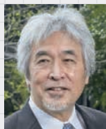
Juichi Yamagiwa (Speaker)

Director, Monash Sustainable Development Institute, Professor of Planetary Health, Monash University, Australia Bioeconomy for human wellbeing and planetary health